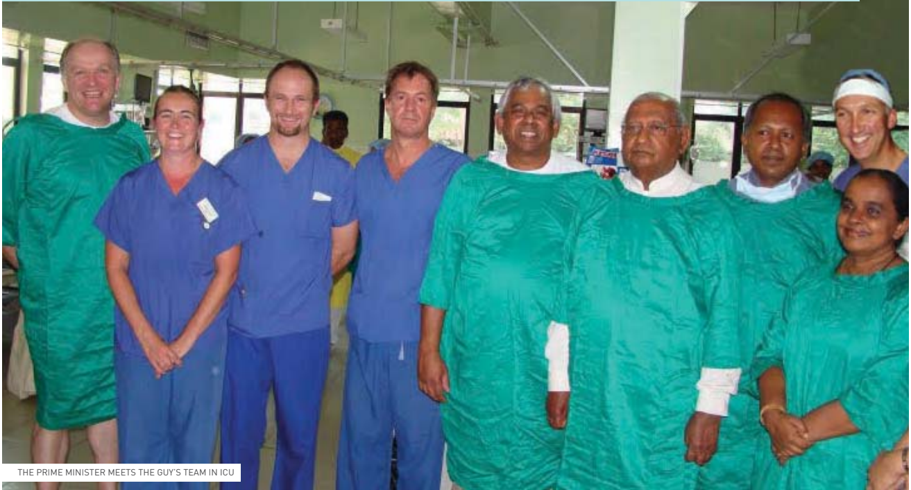
THE PRIME MINISTER MEETS THE GUY'S TEAM IN ICU